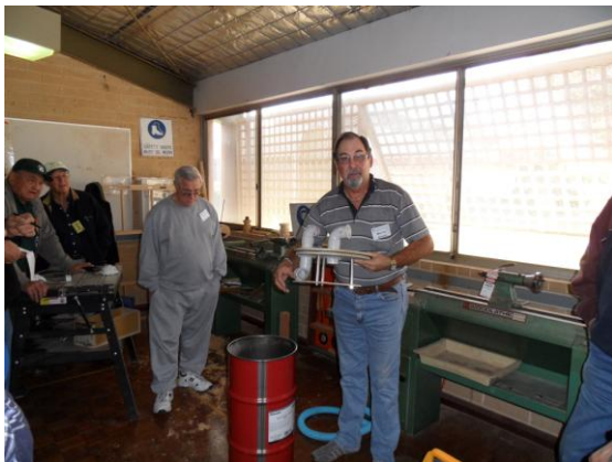
Thien Cyclone Separator being demonstrated at JMS

Shortly before our visit concluded, one of the Joondalup members demonstrated his “homemade” Thien Cyclone” dust extractor/collector which was powered by a domestic vacuum cleaner. Rather than attempt to explain how it works, for those who may be interested, Google “Thien Cyclone Separator” or look on our office notice board for details.