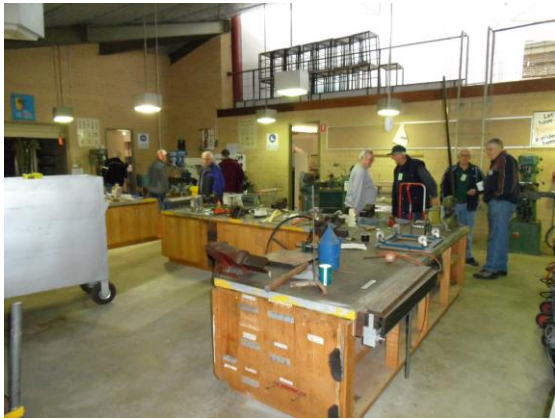
Various pictures of the workshop