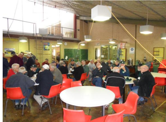
Lunch in the amenities area

In contrast to our "broom cupboard" office come tea area, they had a separate meeting room that easily accommodated all three groups and still had plenty of space available.